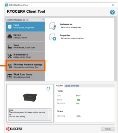
KYOCERA Client Tool

*Image is for illustrative purposes only. Descriptions may differ from the actual content due to page updates.